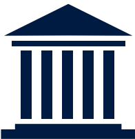
THE COURT OF APPEAL